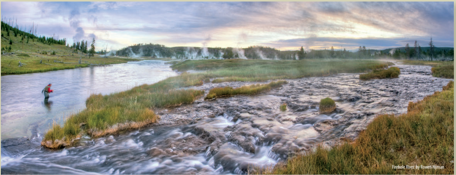
Firehole River by Rowen Nyman